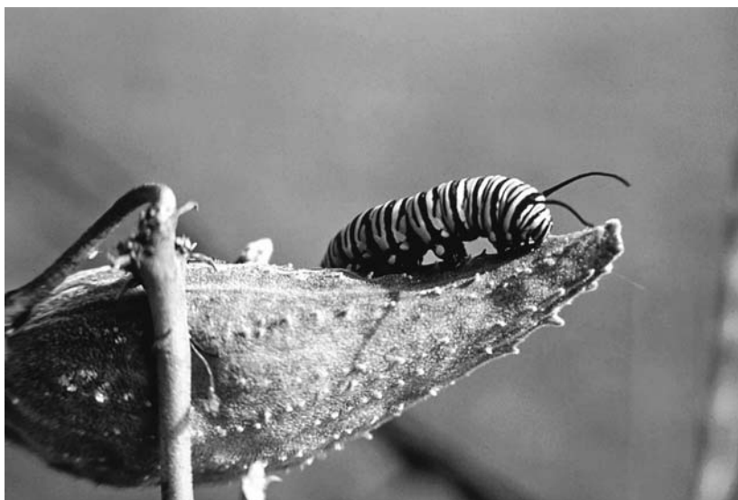
8.3. Monarch butterfly caterpillar Danaus plexippus on a milkweed pod.

mistakable evidence of accelerating mass extinctions, violent climate change, social disintegration, widening wars, ongoing human population increase due to the large numbers of already-born youngsters (even though birth rates most places had fallen below replacement rate), and vast migrations of human and nonhuman refugees without refuges.