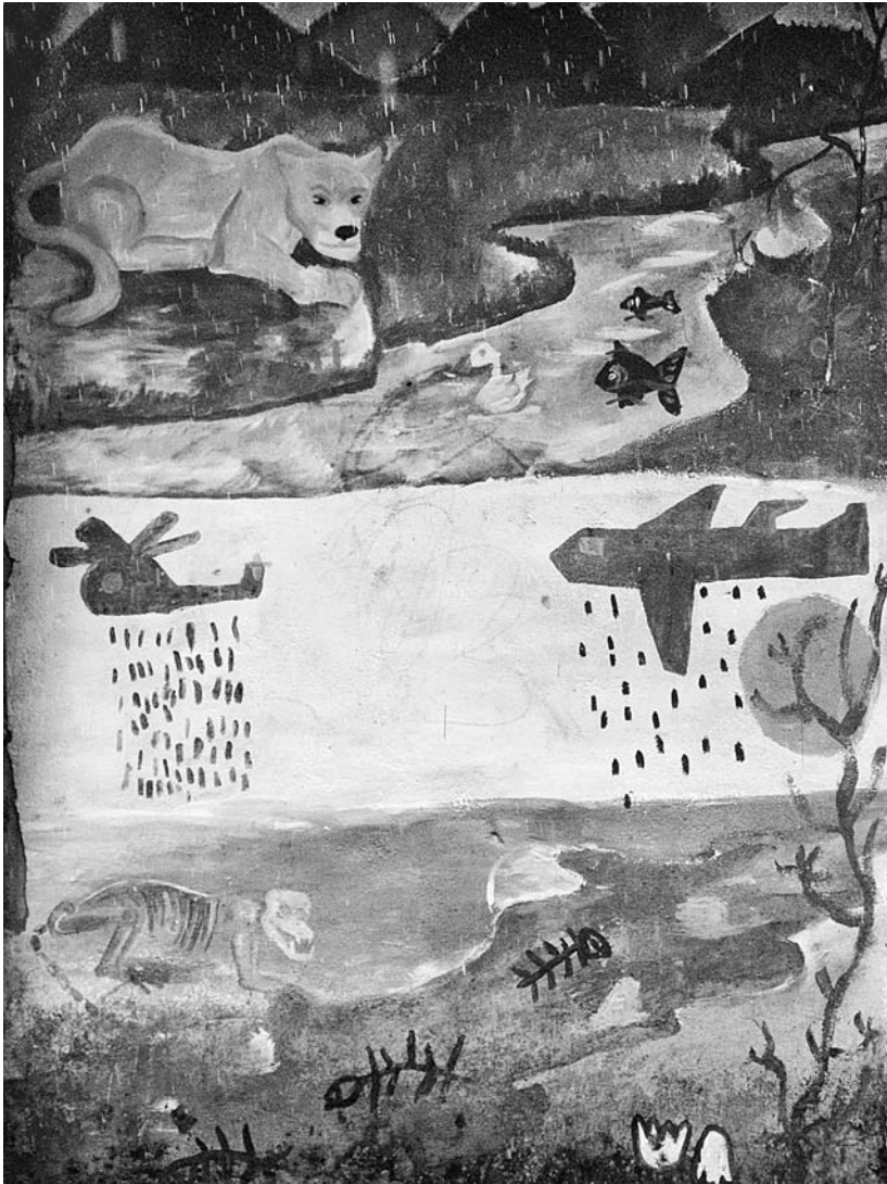
8.5. Mural painted by youth in La Hormiga, Putumayo, in southwestern Colombia depicting landscapes before and after aerial fumigation during the U.S.-Colombia "War on Drugs." Photograph by Kristina Lyons.