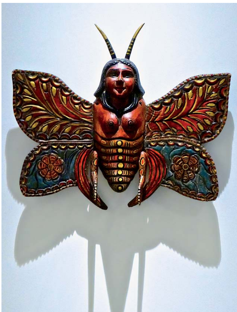
8.1. Mariposa mask, Guerrero, Mexico, 62 cm × 72.5 cm × 12.5 cm, before 1990, Samuel Frid Collection, UBC Museum of Anthropology, Vancouver. Installation view, The Marvellous Real: Art from Mexico, 1926–2011 exhibition (October 2013—March 2014), UBC Museum of Anthropology. Curator Nicola Levell. Photograph by Jim Clifford.