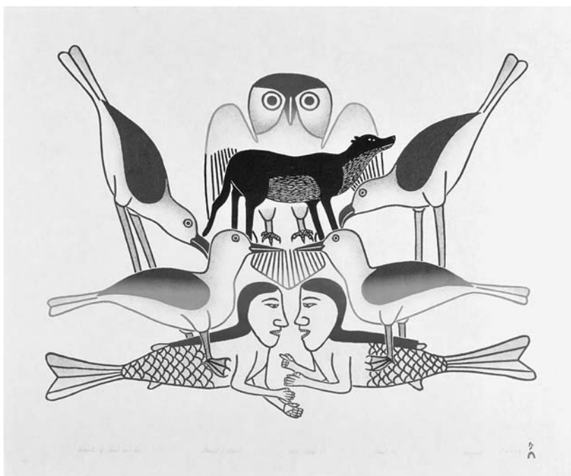
8.6. Kenojuak Ashevak, Animals of Land and Sea , 1991, stonecut with stencil, 25 × 30 in. (paper).

and among syms and non-syms was the daunting task of Camille 3's generation.