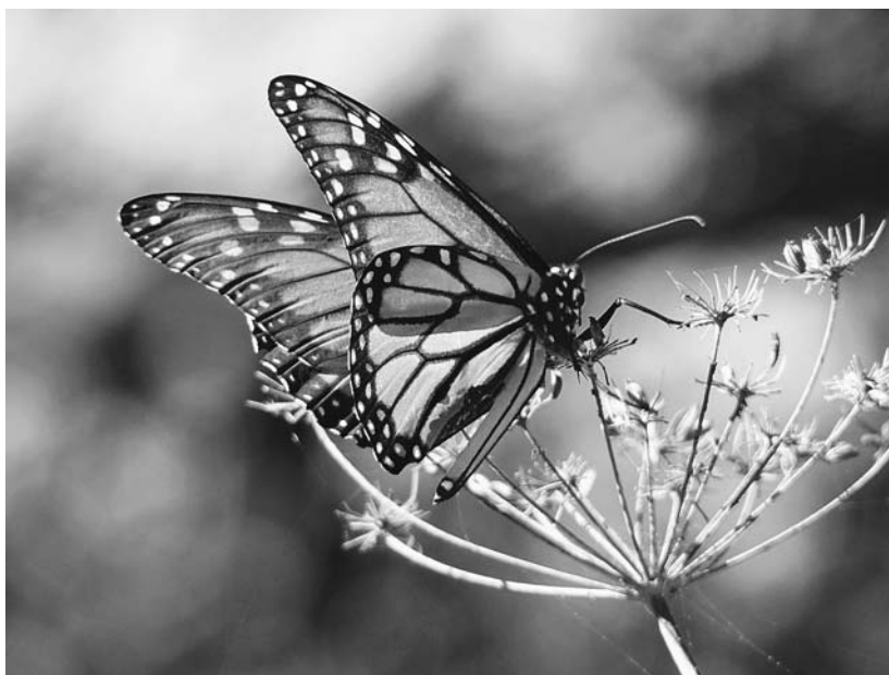
8.4. Monarch butterfly resting on fennel in the Pismo Butterfly Grove near the entrance to Pismo Beach State Park, November 15, 2008.

ple, nature lovers, gardeners, corridor ecologists, insect specialists, and climate scientists, as well as artists performing with and for nonhuman critters. Although based in New Gauley and attuned especially to the ravaged landscapes and peoples of coal country there and across the continent, 31 Camille 1 also sojourned with the insects and their people in the winter homes of the western migration of the monarchs, especially along the Monterey Bay of Central California. So per understood the biological, cultural, historical worlds of these clusters of monarchs clinging to their local Monterey pines and crucial (if never really accepted by ecological nativists) Australian gum trees.