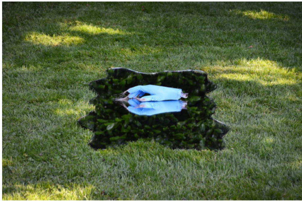
Carolynne Yardley: Remnants 5 , from Pandemic Sculpture Garden series, 2020 Mirror, mannequin hand, used nitrile examination glove, false nails, squirrel hair, 36.5" X 32" X 4"

Here's a sampling of their work, with artist statements taken from the ECUAD website .