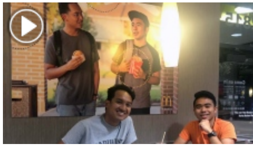
Texas students pull off poster prank at McDonald's