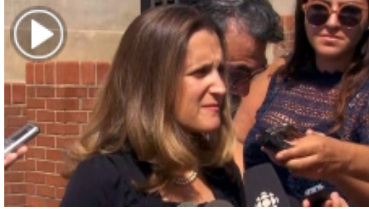
LIVE as it happens: NAFTA talks resume in Washington