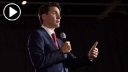
LIVE Soon: PM Trudeau delivers remarks in Edmonton