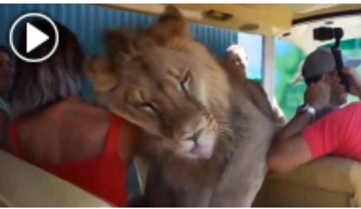
Lion cuddles, licks tourists at safari park in Crimea