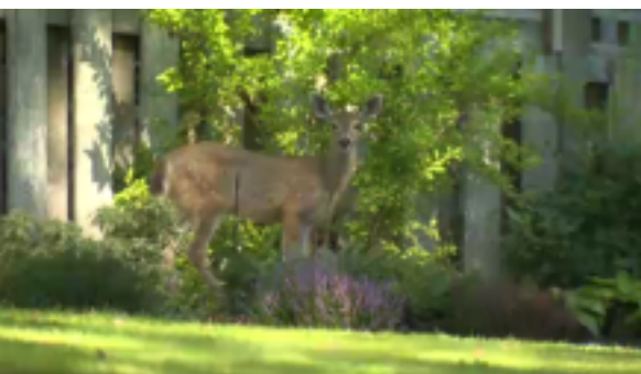
A woman from Oak Bay, B.C. says she was attacked by deer in her backyard.

It's just the latest incident involving deer on Vancouver Island. Last week, a woman in Comox, B.C. was pinned by a deer in her yard after she tried to help the animal that had become entangled in some netting.