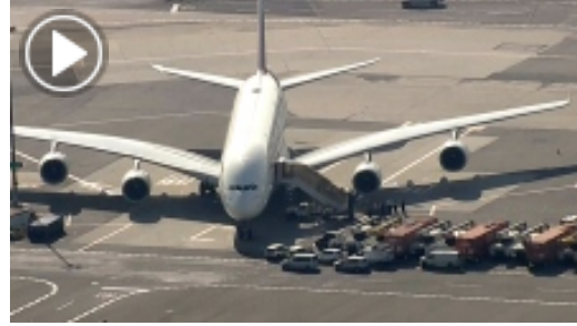
Emirates plane grounded, quarantined at JFK Airport in N.Y.